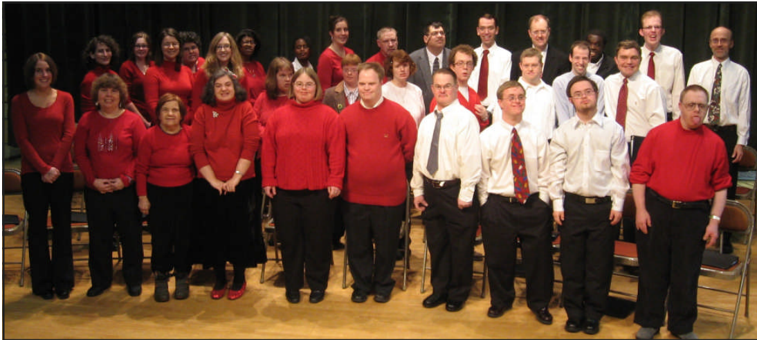
The AR&LE Singers Holiday Concert on December 7, 2008, attracted nearly 300 audience members who enjoyed the singing and song introductions by the choral group at Edinborough Indoor Park.

Register now for the AR&LE Spring “Awesome Nature Retreat” Saturday, May 2nd 10:00 am to 2:00 pm Details on page 14