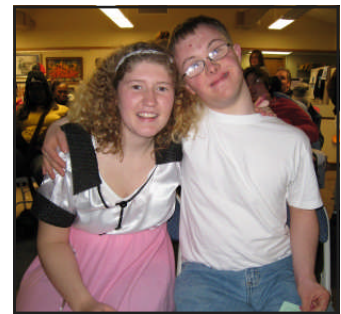
Over 130 people attended the "Grease" Dance Your Socks Off/Movies & Munchies Dance-Along Event. For more movies, see Movies & Munchies on page 11.

Cost: $5 Cover Charge at the door (support staff free)